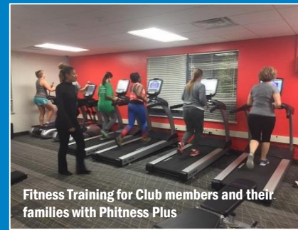
Fitness Training for Club members and their families with Phitness Plus

Committed to Healthy Lifestyles with Phitness Plus