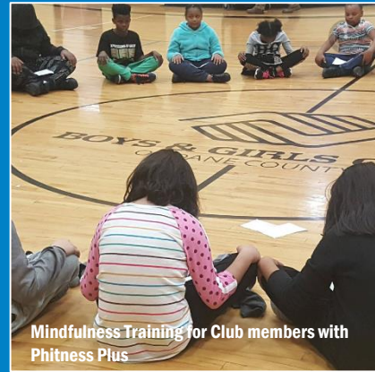
Mindfulness Training for Club members with Phitness Plus